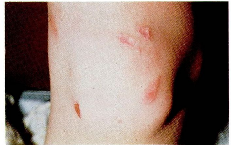
Fig. 3. Typical scarring of EDS, mild (brother of patient).

crusted papules on the nose and chin. Echinomoses were absent and the tongue was not hyperextensible (negative Gorlin's sign). Examination of the patient's mother revealed mild skin stretchability and moderate joint laxity. The patient's 10-year-old brother had several scars on the elbows and knees identical to those seen on the patient (Fig. 3); his skin was mildly hyperextensible and the joints of his hands were moderately lax. Results of physical examination of the father of the patient and a 15-year-old brother were normal.